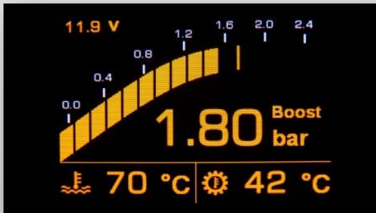
Boost pressure display