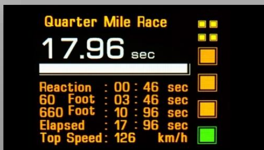
Quarter mile - Display