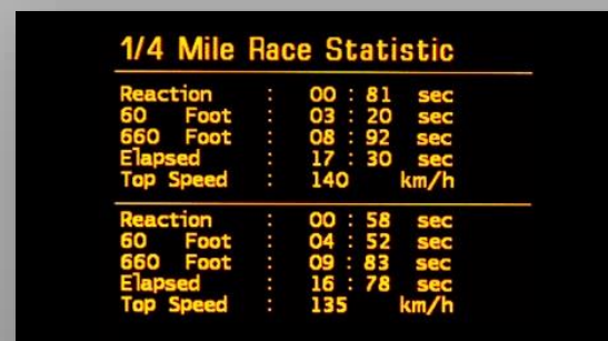
Quarter mile- Maximum values