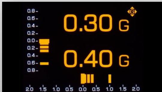
Lateral and Longitudinal acceleration